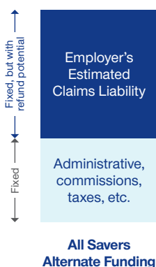
Figure 2 shows how, with an alternate funding plan, the employer assumes the financial risk of providing health services to the employer group. It establishes a medical benefits plan that pays for employees' medical claims directly. These costs may vary from month to month throughout the year. But because the plan is level funded, the administrative fees, stop loss premium and monthly maximum claim liability are included in one monthly invoice—the amount of which is fixed—throughout the plan year.

At the end of the plan year, if the total health care claims are lower than anticipated, the employer may receive money back (where allowed by state law). If they're higher? The stop loss insurance policy covers them.