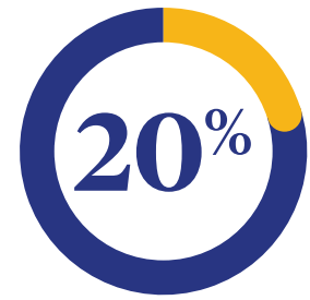
average retail gym membership savings with One Pass Select 3

Half of U.S. consumers report wellness as a top priority in their daily lives. 1 One Pass Select™ is designed to help make it easier for your employees to prioritize their health and wellness through a lower-cost, extensive nationwide gym network—including digital fitness options. Best of all, your employees have the freedom to choose the option that fits their needs and lifestyle.