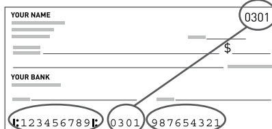
Routing number Check number Account number